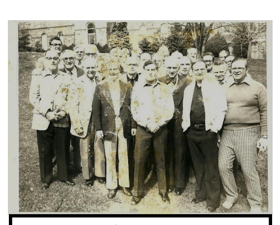
Brother Knights from years past at retreat.