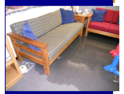
Water floods rooms ruining carpet and furniture.