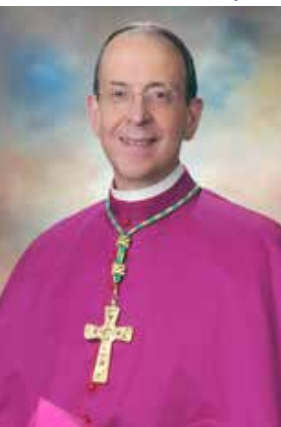
Archbishop William E. Lori Supreme Chaplain

Left to my own resources, I can't adequately answer that question, for the good of the Order cannot be reduced merely to my opinions. The same is true of every Knight of Columbus. The Order we joined is not a debating society, nor is it an arena where we play out a contest of wills. Rather, it is an organization rooted in charity, which expresses itself in genuine unity of mind and heart and in a brotherhood of service. In fact, our ability to do great good for our members, our Church and our world depends on our willingness to preserve and strengthen this solidarity.