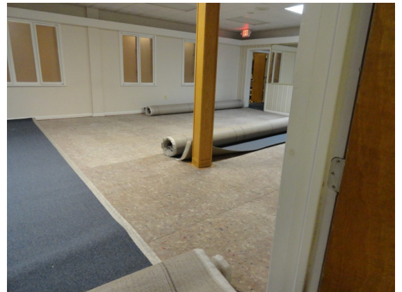
New carpet being installed in the Blue Room.

In the coming weeks there will be work on the outside and the gardens at the Council Home.