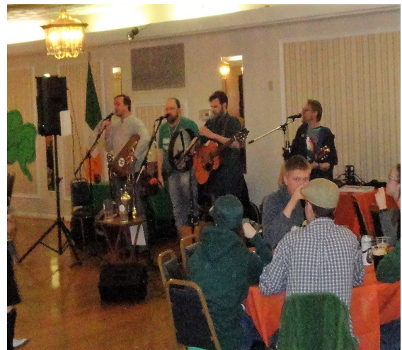
The Irish band The Hooligans.